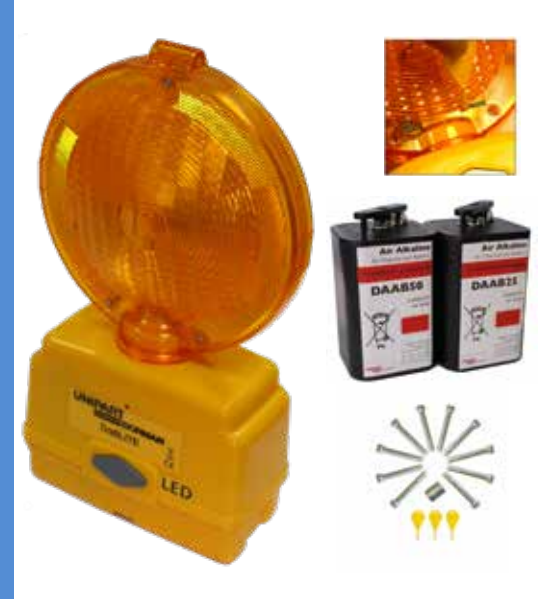
TLL8S 3-Way (Flash-Steady-Off) Amber TLL8S-R Red