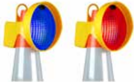
This image is for lens colour guidance only - the lamp is a ConeLITE Synchro

CCL6S/AA/P/N/LA (Flash) CCL2S/AA/P/N/LA (Steady)